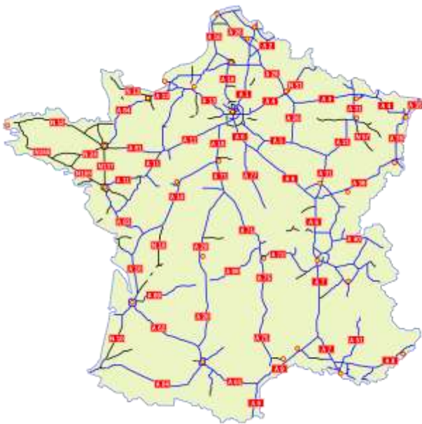
Road network of France